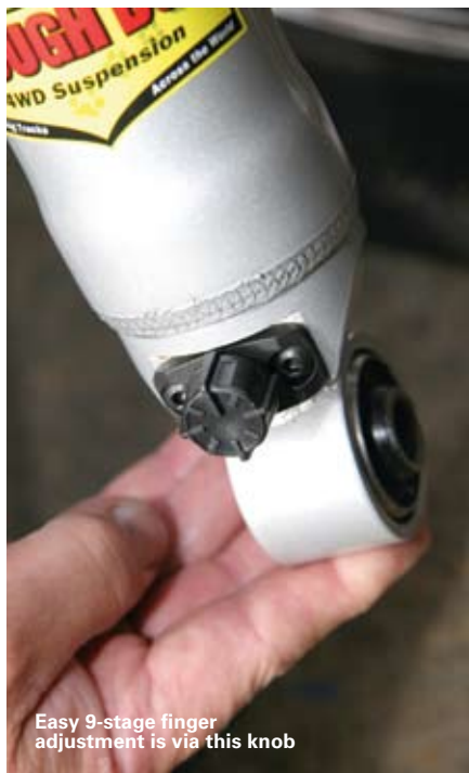
Easy 9-stage finger adjustment is via this knob

While this new higher-tech spring steel is more expensive per kg, the lower amount used in each coil means there is no increase in price – a win win situation.