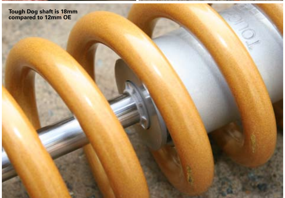
Tough Dog shaft is 18mm compared to 12mm OE