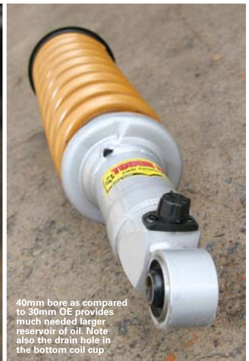
40mm bore as compared to 30mm OE provides much needed larger reservoir of oil. Note also the drain hole in the bottom coil cup